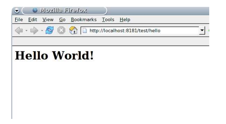
Figure 2: Output of hello world handler.